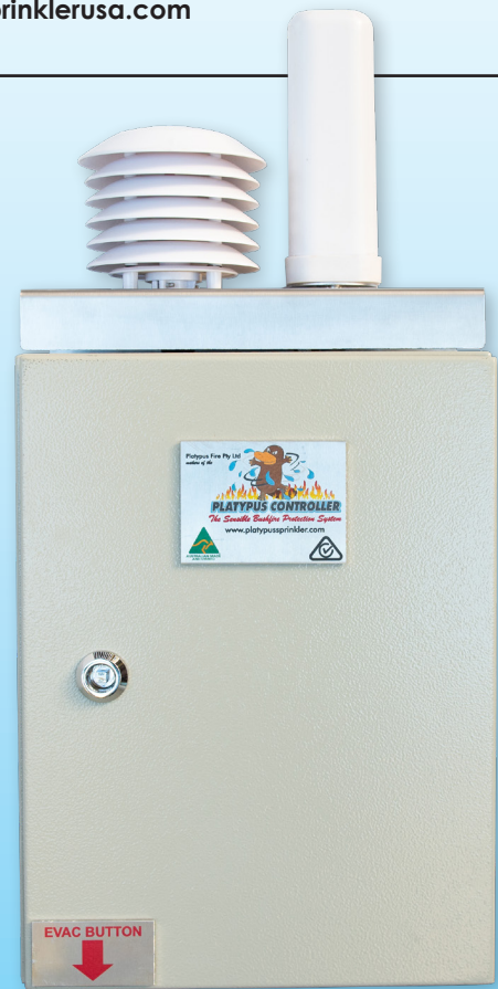
Controller shown with optional enclosure mounted temperature sensor and antenna.